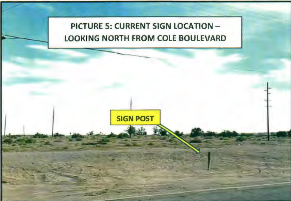
PICTURE 5: CURRENT SIGN LOCATION – LOOKING NORTH FROM COLE BOULEVARD