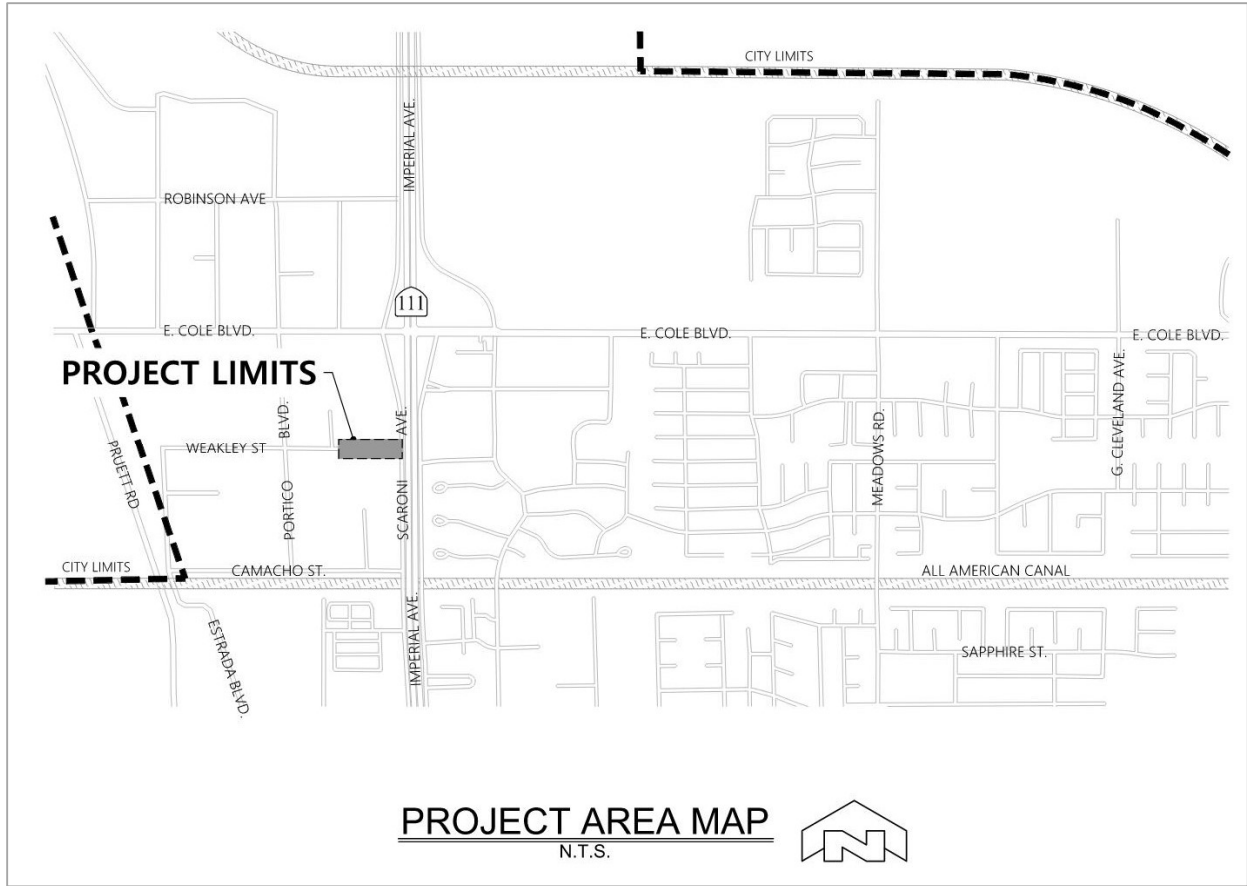
Figure 02: Project Limits