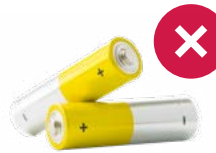
Batteries & Electronics